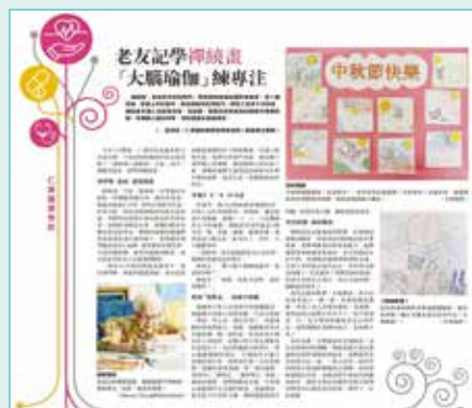
《明報副刊 Mingpao Feature Section》