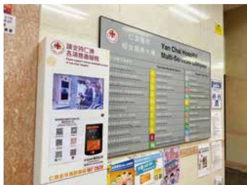
仁濟醫院社會服務綜合大樓地下電梯大堂設有八達通捐款機 The Octopus Donation Machine is installed at the lobby of the Yan Chai Multi-Services Complex

仁濟醫院社會服務綜合大樓地下電梯大堂及位於C座大樓六樓之董事局蘇啟聲牙科診所設有八達通捐款機，為廣大善長提供一個便捷的捐款途徑，同時減省本院點算硬幣的行政資源和時間，提升籌款效益。