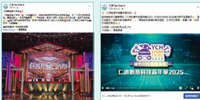
利用仁濟Facebook專頁推廣各類服務及籌款訊息，增強與受眾互動 We make use of the YanChai Facebook page to promote various kinds of services and fundraising events to enhance engagements and interaction with the public