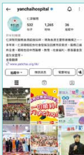
本院亦有利用IG平台以接觸更多年輕受眾 We use the IG platform to reach more young audiences