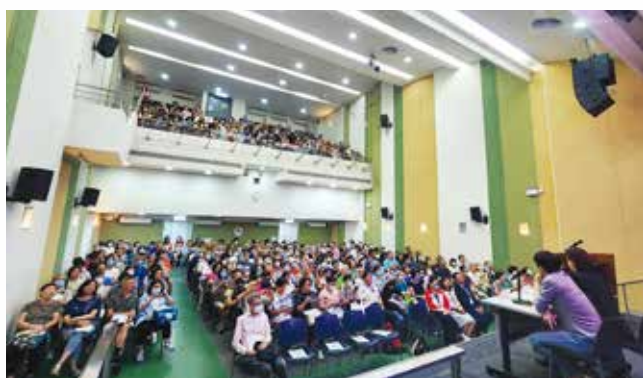
是次講座吸引約250名公眾人士出席 About 250 audiences attended the seminar

Yan Chai is driven by a profound sense of mission to serve society and assist the underprivileged. The activities organised by Yan Chai have received significant support from diverse sectors of the community, uniting in a shared commitment to address the needs of vulnerable individuals and foster positive change. Throughout the year, Yan Chai has launched several donation campaigns, garnering strong public support.