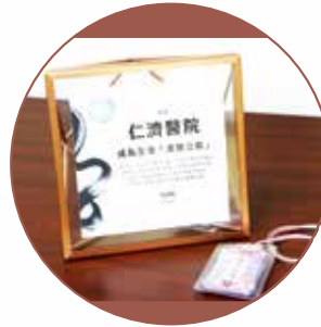
本院感謝各方善長支持仁濟善業 We would like to thank all the donors for their support

Yan Chai Hospital has been working with the social enterprise "ForeverGift.hk" to encourage the public to donate some of their legacy when making wills for the benefit of the community through Yan Chai Hospital. We are honored to receive high praise once again from "ForeverGift.hk" and be recognised as one of the "Top 10 Charitable Organisations with the Highest Number of Legacy Donors," and "Top Ten Charitable Organisations with the Highest Amount of Legacy Donations" in 2023-2024 in Hong Kong. We express our sincere gratitude for the support and trust bestowed upon us by our donors as we will continue our mission to serve the community.