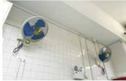
有善長支持計劃，讓院屬明德幼稚園購置電風扇改善學校廚房環境 Yan Chai Hospital Ming Tak Kindergarten installed new electric fans in the kitchen to improve the environment with the support from donors

The Programme invites philanthropists to contribute specifically towards the costs of designated medical equipment or educational facilities required by Yan Chai. This initiative ensures that individuals in need and students directly benefit from the generosity of donors. In appreciation of their contributions, the names of the donors will be commemorated on the donated items as a lasting tribute.