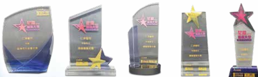
本院連續五年獲《星島日報》主辦的「服務大獎」嘉許 Yan Chai Hospital has been honored with the "Sing Tao Service Awards" at the "Star Diamond Service Awards" ceremony hosted by Sing Tao Daily for five consecutive years

另外，仁濟獲香港消防處頒發「AED睇得到 用得到」計劃傑出表現獎，以嘉許本院在提高AED在社區的普及率。