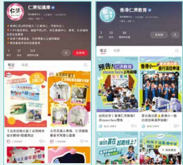
新增兩個「小紅書」帳戶讓推廣服務層面廣及至大灣區居民及更多新來港人士 Establish two new "Xiaohongshu" accounts to extend the promotion of Yan Chai's services to residents of the Greater Bay Area and the new arrivals