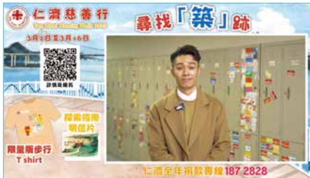
周柏豪 — 呼籲公眾支持仁濟慈善行 Mr. Pakho CHAU appealed for support towards Yan Chai Charity Walk

本院的慈善工作獲多位知名藝人認同及肯定，如協助參與拍攝宣傳短片及開設生日籌款專頁，為仁濟籌款。