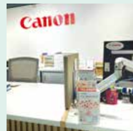
仁濟慈善捐款箱現設置於佳能數碼影像坊 A donation box of Yan Chai is currently placed at Canon Image Square