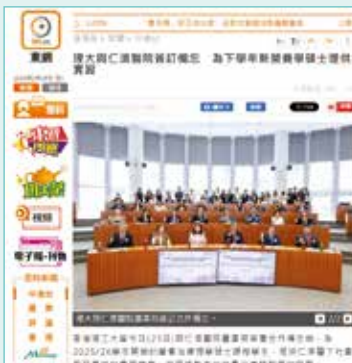
仁濟的活動及服務吸引多間媒體作出正面報導 Yan Chai's activities and services attracted positive media coverage