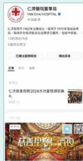
仁濟微信 Yan Chai WeChat