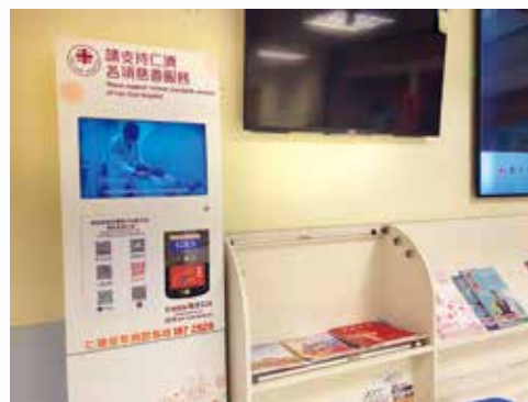
蘇啟聲牙科診所 So Kai Sing Dental Clinic

Yan Chai Hospital has installed Octopus Donation Machines at the lobby of the Yan Chai Multi-Services Complex and the So Kai Sing Dental Clinic on the 6th Floor of Block C. These machines offer a convenient donation option for generous supporters, while also reducing the administrative resources and time required for manually counting coins.