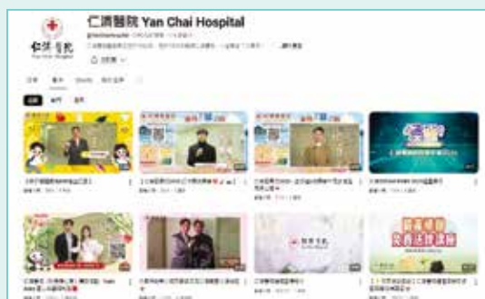
仁濟YouTube頻道 Yan Chai YouTube Channel