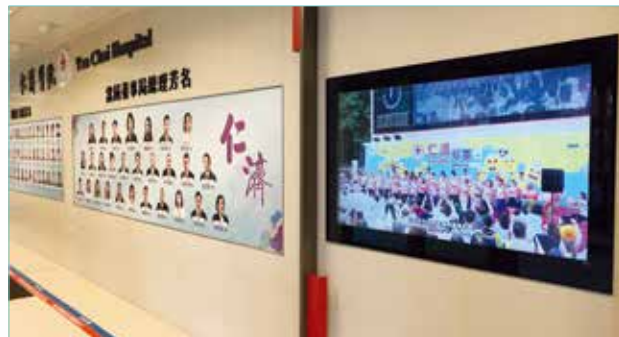
仁濟醫院機構宣傳片在多個渠道播放 Yan Chai Hospital corporate video is broadcasted in multiple channels