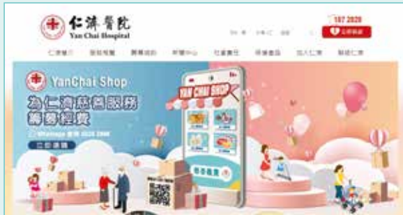
透過仁濟官方網站推廣仁濟商店 Promote the YanChai Shop through Yan Chai Official Website

In order to inform the public more effectively about Yan Chai's latest services, Yan Chai has set up various social media accounts such as Facebook, Instagram, YouTube, and Xiaohongshu. We make good use of the advantages of each platform to timely release and promote important information and service details to the public. This year, we have specially opened two Xiaohongshu account to publish fundraising information and promote education and social services, extending Yan Chai's local service reach to the Greater Bay Area.