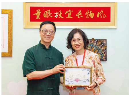
仁濟與懲教署一起為慈善 Yan Chai and the Correctional Services Department work together for charitable purposes