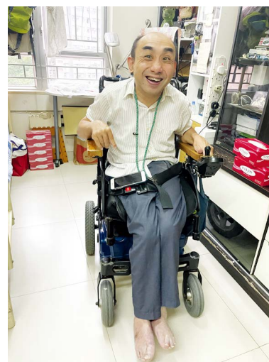
鼓勵殘障人士自強不息 Encouraging disabled individuals to persevere and thrive