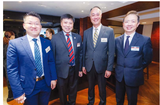
董事局成員與懲教署首長級人員合照 Group photo of the Board Members and Directorate Officers of the Correctional Services Department