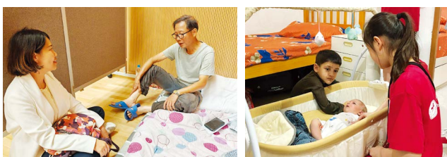
真誠地傾聽 Sincerely listening

「仁濟緊急援助基金」成立於1992年12月1日，宗旨是向遭受不幸事故、意外或災難而徬徨無助的人伸出援手，協助他們渡過經濟難關，援助項目包括殮葬、醫療、復康、災難、生活和租金援助等。基金除向有需要人士提供緊急金錢支援外，亦會提供有關社會福利的諮詢及轉介服務，讓他們得到更完善的幫助。