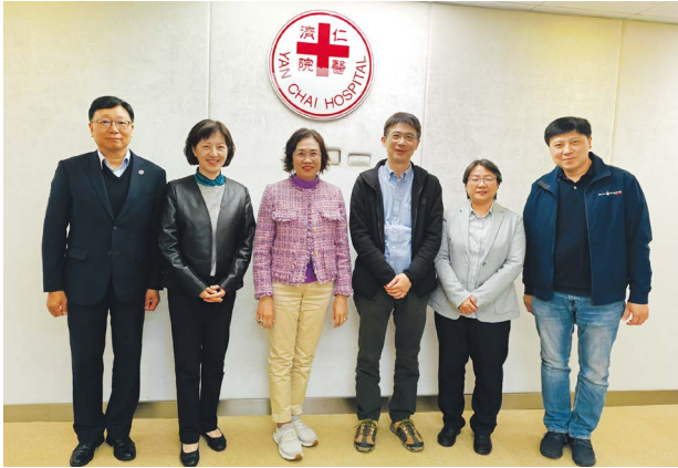
「仁濟永強全癱病人基金」委員會成員合照 Group photo of the committee members of the Yan Chai Tetraplegic Fund

本院在本年新增「聘請外傭津貼」為新援助項目，讓有需要聘請外傭為照顧者的全癱病人有充裕資金，以應付與外傭續約或重新聘請外傭時的支出，例如是簽證、來港機票、家傭保險及身體檢查等費用，藉此使病人在聘請外傭的過程中獲得更大支援，能安心繼續留在熟悉的家居及社區生活。