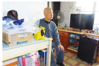
傳遞愛，燃亮生命 Spreading love, illuminating lives

以燃亮生命和宣揚愛心為宗旨，「心愛生命」援助計劃自成立以來，一直支持「仁濟緊急援助基金」的援助工作，使到在困境中的人能克服逆境。