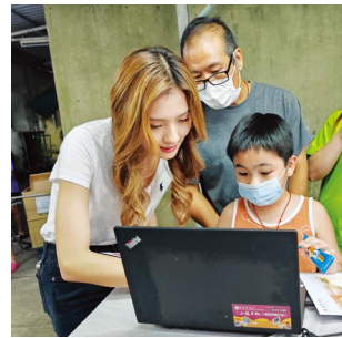
基金向受水災影響的學生送上由「福幼基金會」捐贈的手提電腦 We provided laptops donated by the Caring for Children Foundation to students affected by the flood