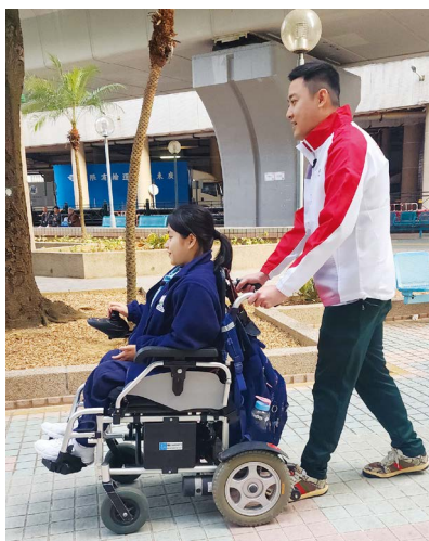
協助全癱患者實現出院回家的路 Supporting tetraplegic patients in their journey home from discharge

四肢癱瘓病人與任何人一樣，都想過有尊嚴的生活，不過由於他們全身不能活動，故如沒有照顧支援及合適的輔助器材，四肢癱瘓患者是難以生活。在2023/2024年度，基金援助了33位有經濟困難的全癱病人，撥款額超過二百萬元。