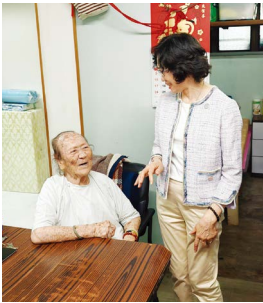
暴雨過後，本院隨即展開援助工作 After the downpour, we immediately initiated relief efforts