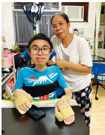
基金致力減輕照顧者的負擔和壓力 The Fund is committed to easing the burden and stress of caregivers

The Fund provides temporary allowances for financially disadvantaged individuals with severe physical disabilities, enabling them to hire caregivers and receive appropriate care. This support allows them to continue living in familiar communities. Each eligible individual can receive up to a maximum of $4,380 in subsidy per month.