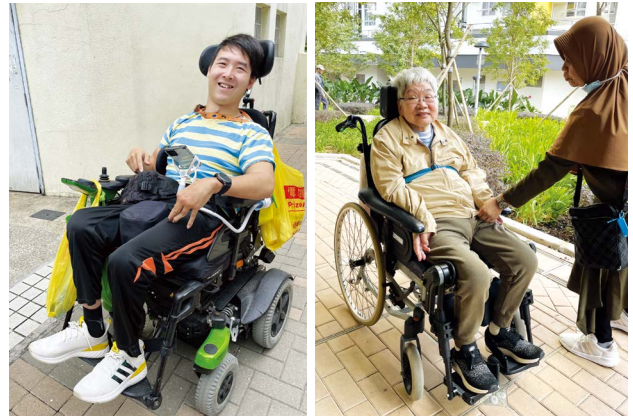
殘疾人也可以活出精彩的人生 People with disabilities can also live wonderful lives

We have introduced a new assistance program called the allowance for hiring foreign domestic helper this year. The aim is to provide adequate funding for tetraplegic patients who need to employ foreign domestic helpers as caregivers. This allowance covers expenses related to renewing contracts or rehiring foreign domestic helpers, such as visa fees, airfare to Hong Kong, domestic helper insurance, and medical examination costs. Through this initiative, our aim is to offer enhanced support to patients during the process of hiring foreign domestic helpers, enabling them to continue living in their familiar homes and communities with peace of mind.