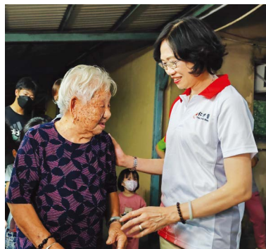
基金向無助的喪親者提供殮葬援助 The Fund offers burial aid to the bereaved in need